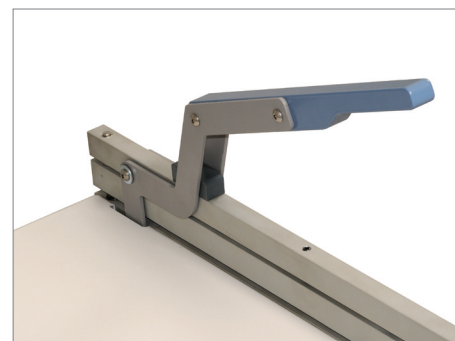
The handle lifts and creases easily and consistently.