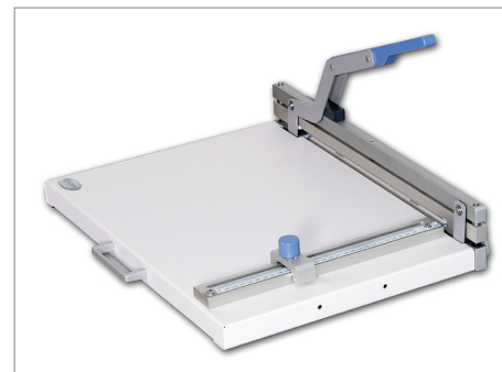
Fastbind FotoCreaser C33™ is a compact, tabletop unit.