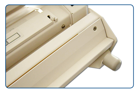
Optional cover trimmer