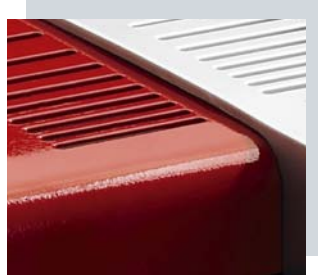
PEAK POUCH LAMINATING SYSTEMS