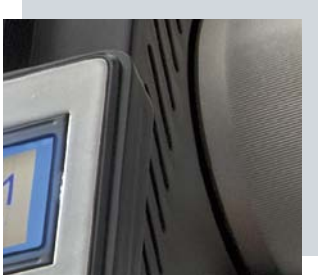
LINEA ENCAPSULATION SYSTEMS