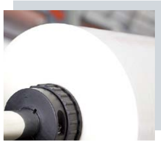
PROLIFE FILM SUPPLIES

Vivid design and manufacture a wide range of laminating systems, specialising in function, style and reliability.