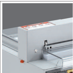
BLADE CHANGING DEVICE