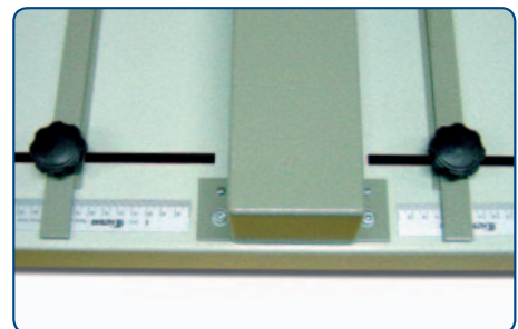
Two alignment bars