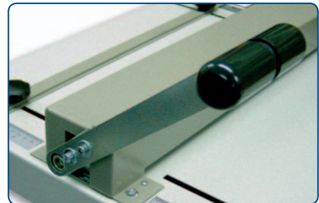
User friendly handle