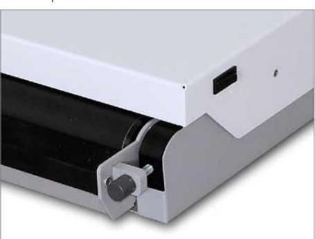
The integrated edge folding unit is adjustable for different cover board thicknesses.