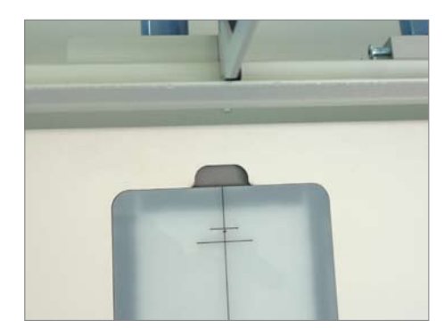
Registration marks for thicker and thinner materials offer you more versatility in applications.

Adjustable edge folding unit and 3 mm spine guides with 8 mm spacers are included. Product information as of April 2009 and is subject to change without notice.