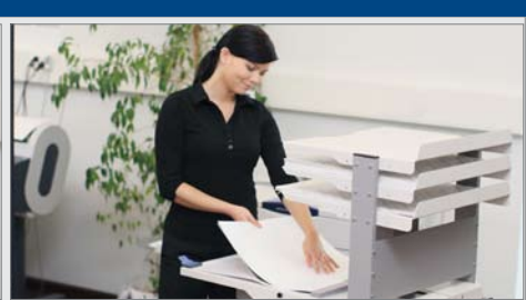
With Fastbind FotoMount F46e<sup>™</sup> large format electrical photobook maker you can create a beautiful and professional photobook yourself. The finished book opens astonishing 180 degrees.