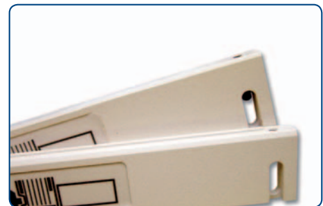
Nipping bars for soft covers and hard covers