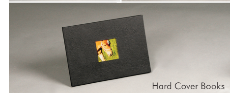
Hard Cover Books