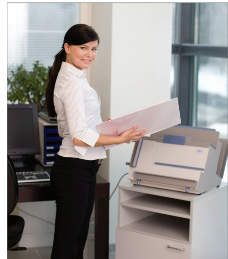
You bind professional books, reports or photo albums in a few seconds.