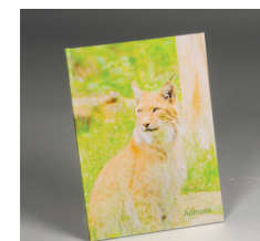
Books With Printed Hard Cover*