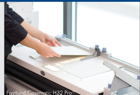
Fastbind Casematic H32 Pro™

The BooXTer Duo features a special built-in casing unit to easily attach the hard cover to the pre-bound contents. You insert the cover in the groove to maintain it and just peel-off the end-sheets with your free hands.